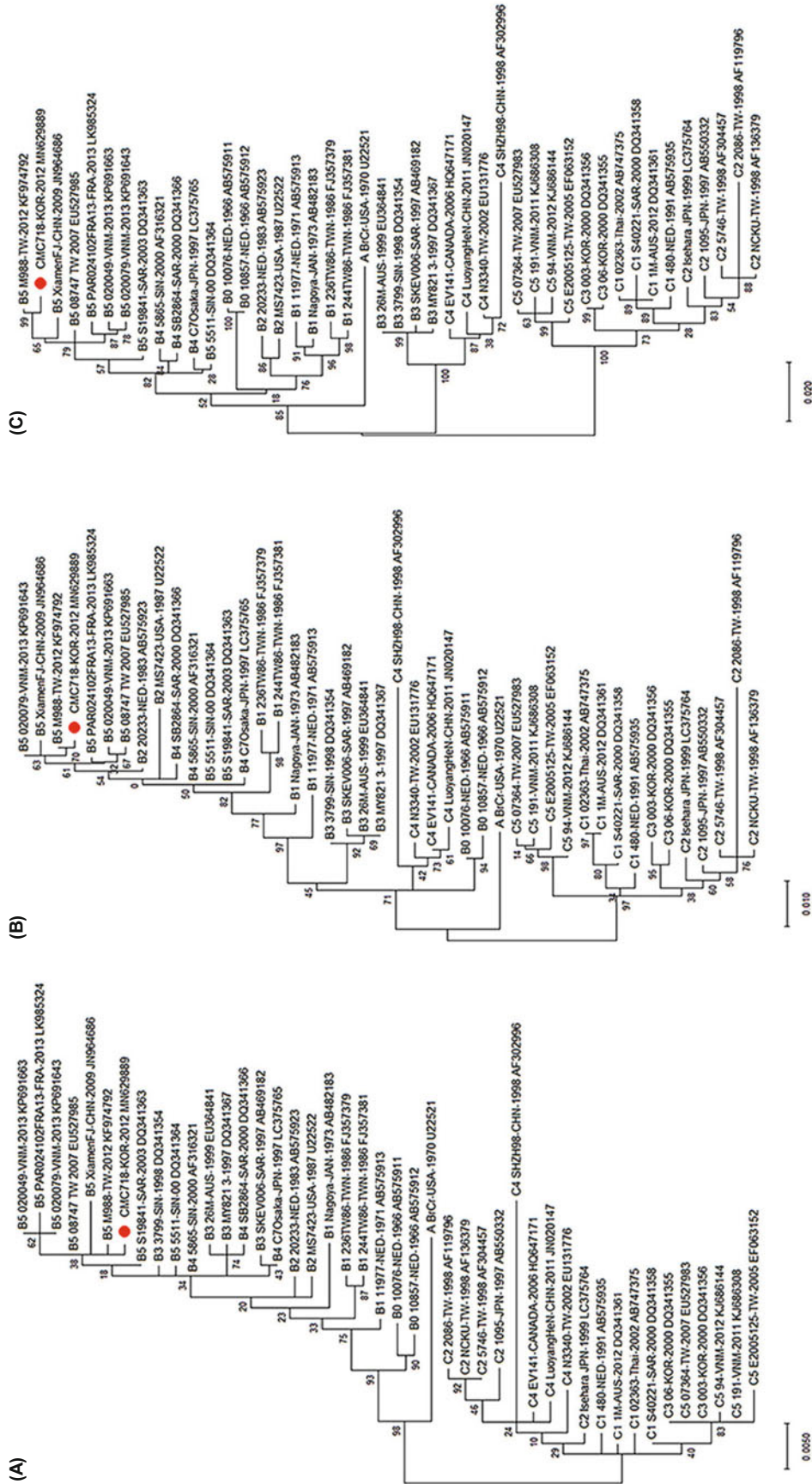
Fig. 2. Phylogenetic analysis of enterovirus A71 based on amino acid sequence. The tree were constructed with the neighbor-joining method. Phylogenetic trees base on (A) amino acid sequence of P1, (B) amino acid sequence of P2, (C) amino acid sequence of P3.