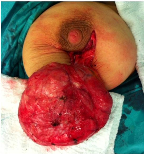
Figure 1. The Appearance of the Encapsulated and Lobulated Mass Excised by Surgery