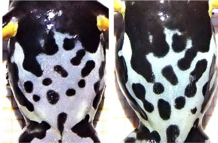
Fig. 1. Example of corresponding juvenile (left) and adult (right) ventral patterns in one Allobates femoralis individual.