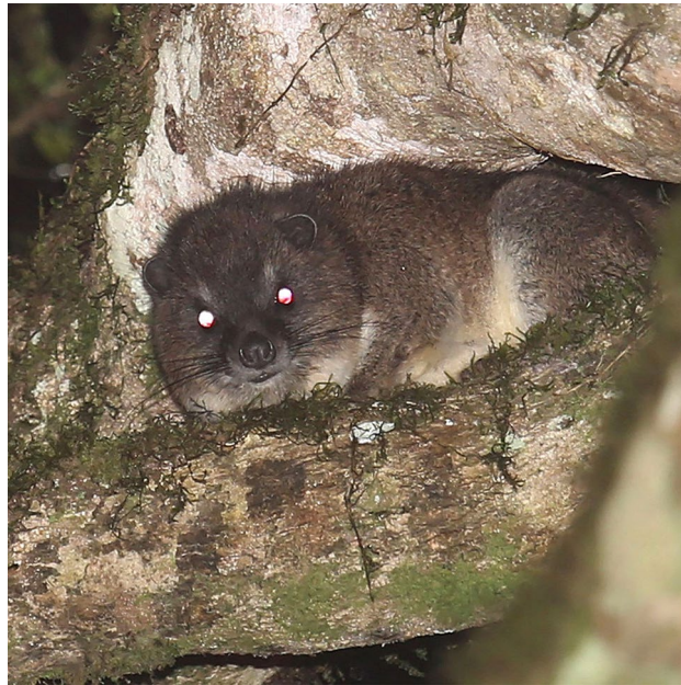
Figure 1. Dendrohyrax sp. resting on a branch of Strombosia scheffleri (Photographed by Hanna Rosti in Mbololo Forest 2021).

tree hyrax D. interfluvialis , are currently recognized; however, additional undescribed species probably await scientific discovery 8–12 . Previously the Taita Hills tree hyraxes were supposed to represent eastern tree hyrax D. validus 13 . This species was originally described by True 14,15 from Mt Kilimanjaro, Tanzania, and Taveta, a border town in present Kenya, close to Kilimanjaro. However, the Taita Hills tree hyraxes differ from typical D. validus in many respects. For example, their vocalizations include distinctive songs, and their most frequently used call is the unique and earsplitting “strangled thwack” 12 . Rosti et al. 12 suggested that the Taita Hills hyraxes may belong to a previously unrecognized taxon and here, we provisionally refer to these animals as “ Dendrohyrax sp.”