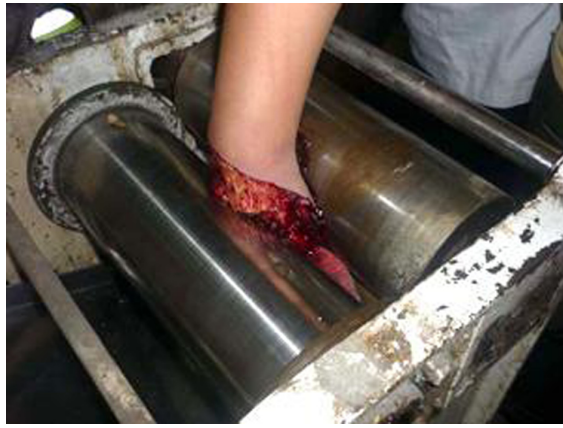
Figure 1 Total hand skin degloving injury caused by roller.

vein of forearm was transplanted intraoperatively; in the meantime, the arteria digitalis communis and ulnar artery were anastomosed. After surgery, the patient was followed-up for 2 years, and satisfactory efficacy and hand function had been attained, which were rarely reported in previous literature. Thus, the current study aimed to introduce our successful experience in this case.