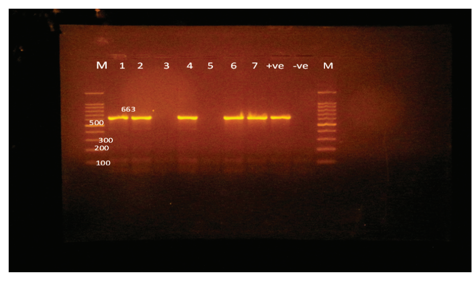
Fig. 3. Agarose gel electrophoresis of PCR products of 16S rRNA (663 bp) as species specific gene for confirmation of Vibro spp isolated from O. niloticus . Lane M: 100–1,000 bp. DNA Ladder. Lane (1,2,4,6&7): positive Vibro spp. Lane (3&5): negative Vibro spp. Lane +ve.: positive control for Vibro spp (at 663 bp.). Lane -ve .: Negative control or Vibro spp.

shown in Figure 3, five out of the seven isolates showed positive outcomes for the 16s rRNA gene, which has a molecular weight of 663 bp.