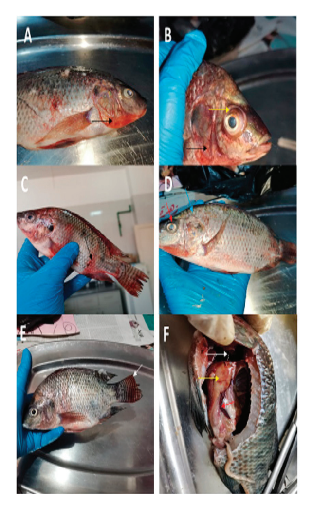
Fig. 1. Naturally infected O. niloticus showed body haemorrhages (Black arrow) and corneal opacity (Red arrow) with unilateral and bilateral exophthalmia (popeyes) (Yellow arrow) in (A–C), scale detachment (Blue arrow) in (D), fin degeneration and erosions (White arrow) in (E), while postmortem examination showed friable enlarged liver with marbling appearance (Yellow arrow), with splenomegaly (Red arrow) and congested gills (White arrow) in (F).

Anorexia, lethargy, surface swimming, body hemorrhages, scale detachment, fin degeneration and erosions, and corneal opacity with unilateral and bilateral exophthalmia (popeyes) were all symptoms