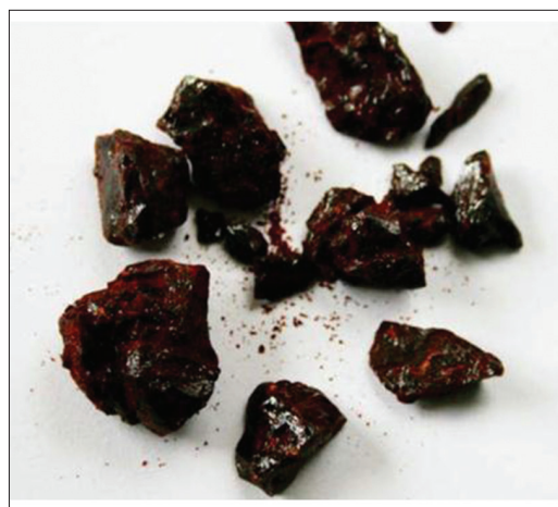
Figure 1: Dragon’s blood resin from Dracaena draco

The D. draco resin has been used since ancient times for artistic purposes and by traditional medicine as haemostatic,