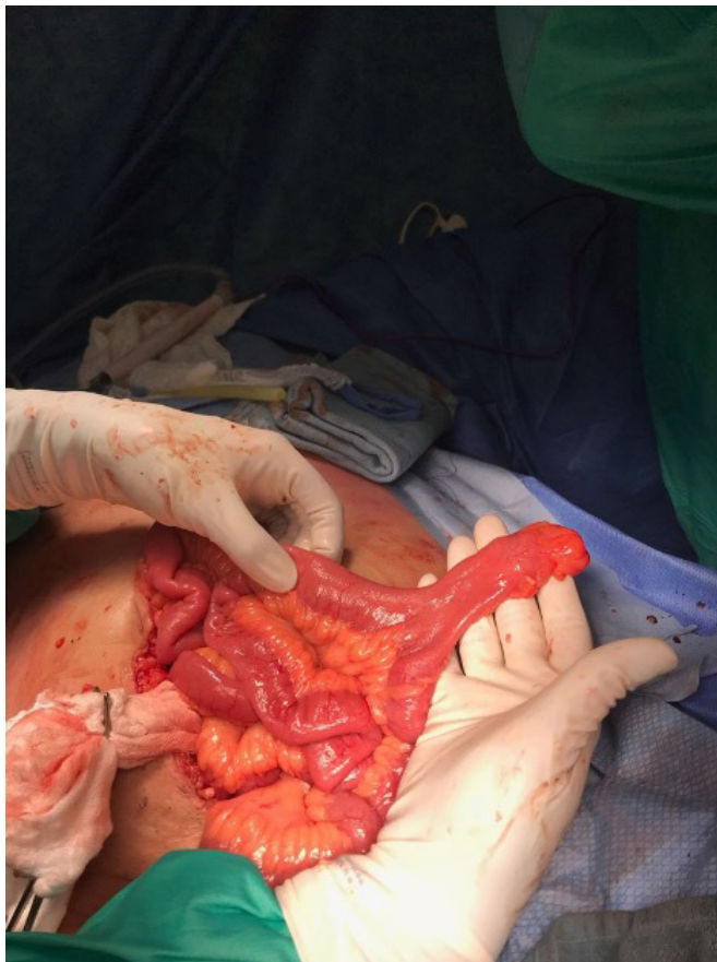
Figure 2 Incidental Meckel's diverticulum found near the location of planned diverting ileostomy site.

Operative management of perforated diverticulitis continues to evolve and the chosen approach ultimately depends on patient and disease factors encountered during surgery. The Hartmann's procedure is the most traditional and conservative approach.