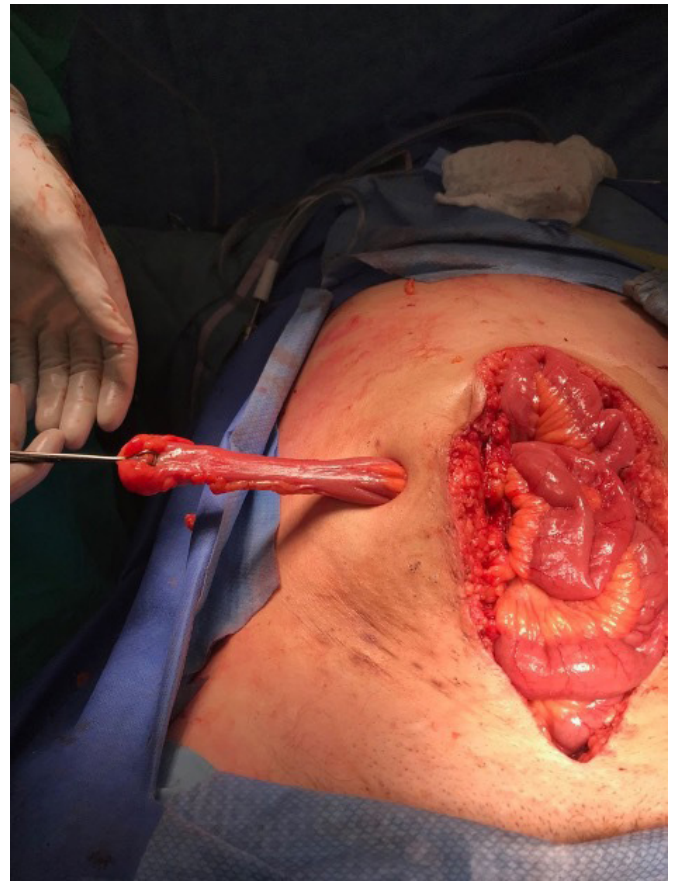
Figure 3 Meckel's diverticulum brought out through right lower quadrant ileostomy site prior to diverticulectomy.

More recently, sigmoidectomy with primary anastomosis and loop ileostomy has gained favor with similar short-term outcomes, and possibly better long-term outcomes in relation to stoma-free status at 1 year. Our case highlights two challenges for the acute care surgeon. First, managing perforated diverticulitis in the immunocompromised patient; and second, navigating an incidental MD in close proximity to an optimal loop ileostomy location. We describe a novel approach to this dilemma by creating a loop ileostomy at the site of MD. We would recommend this approach to others who encounter similar pathology.