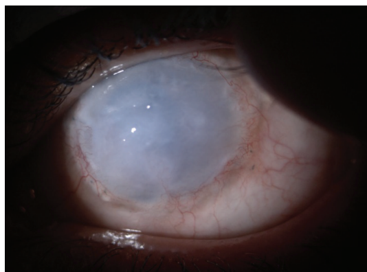
FIGURE 3: Totally opaque graft.

Reinfection was observed in 19 (40%) of eyes that received TPK surgery. Despite vigorous antimicrobial topical and general treatment and repeat tectonic surgery (3 penetrating keratoplasties, 2 total penetrating keratoplasties, and 1 corneoscleral patch graft), 11 (58%) of reinfected eyes developed endophthalmitis, which demanded the radical surgical approach of evisceration. Three eyes developed phthisis.