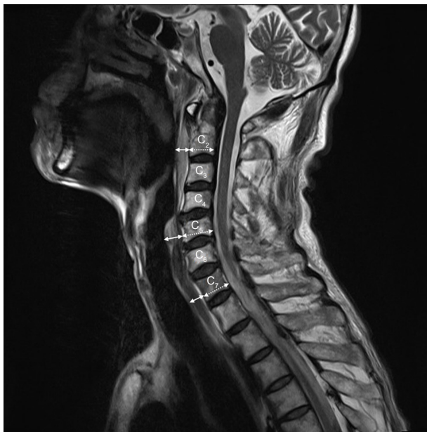
Figure 1 Measurements of RPS in 2nd, 5th and 7th cervical spine level in median sagittal MRI images.

All measurements were analyzed by three anesthesiologists who were blinded to anesthesia records, including laryngoscopic grade; a consensus was reached for each measurement. In cases of disagreement with a difference of more than 10%,