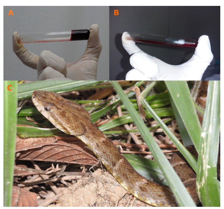
FIGURE 2: A) Negative WBCT20 result (clotted blood); B) Positive WBCT20 result (unclottable blood); C) Common lancehead ( Bothrops atrox ), the snake responsible for most snakebites in the region. WBCT20: 20-minute whole blood clotting test.

WBCT20 was found to be a predictor of the systemic alterations caused by snakebite envenoming and aided in the recommendation for immediate antivenom therapy, thus preventing patients from being exposed to the adverse effects of antibiotics or unnecessary serotherapy. Some cases of altered coagulation time in patients either bitten by nonvenomous snakes or those with dry bites