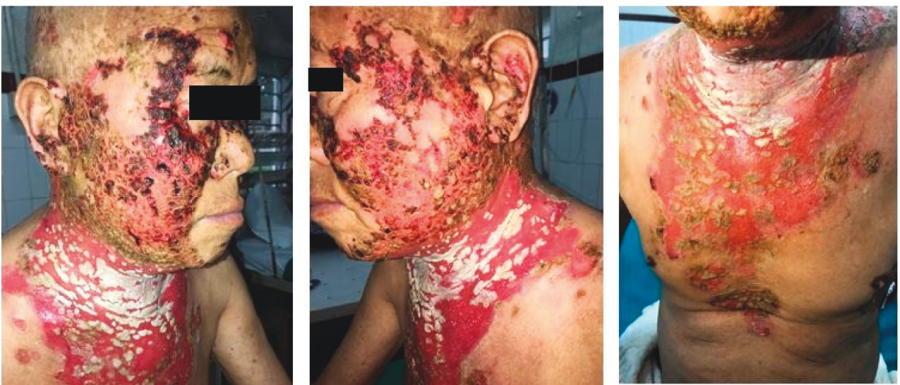
FIGURE 4: Day 23 of admission: extensive haemorrhagic crusts in the face and few in the periphery of erosions in the chest.