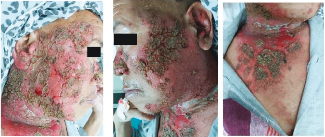
FIGURE 2: Day 1 of admission: extension of erosions despite high-dose oral steroids.