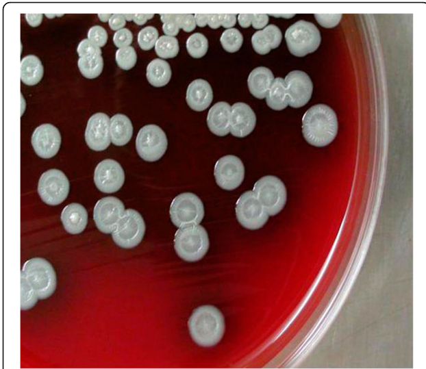
Fig. 2 Burkholderia pseudomallei colonies on blood agar: they are creamy white with concentric ring-like pattern

resistant to ceftazidime and most other antibiotics. It was only susceptible to imipenem and TMP-SMZ. Our patient recovered following treatment with intravenous imipenem and oral TMP-SMZ for 4 weeks, and 3 months of oral TMP-SMZ, as per the recommendations. He was doing well on follow-up. Intravenous imipenem and oral TMP-SMZ may prove efficacious for the treatment of suppurative parotitis caused by B. pseudomallei .