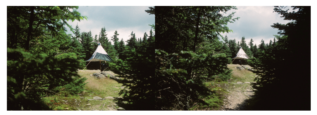
Figure 2. Canopy trap in Hut Clearing. Elevation 1158 m. Lower black part of trap changes bright reflection at right to a more "flat" black at left with a 90 degree turn of polarizing filter on camera lens. Photo here is from opening as Long Trail enters from the north. The Hut Clearing is a four-way junction of trails on Camel's Hump and a convenient place for a trap, fully visible to flies.

duce reflection "by 1000-fold". Facets on ommatidia on the upper half of the holoptic compound eye of many male dipterans can be twice the diameter of those on the lower portion. But not all males of Muscidae show this, nor do all tabanids. Wilkerson et al. (1985) included diameters ranging from 100 percent larger down to 30 percent larger. Mazokhin-Porschniakov (1969) provided a listing of arthropods known to respond to polarized light.