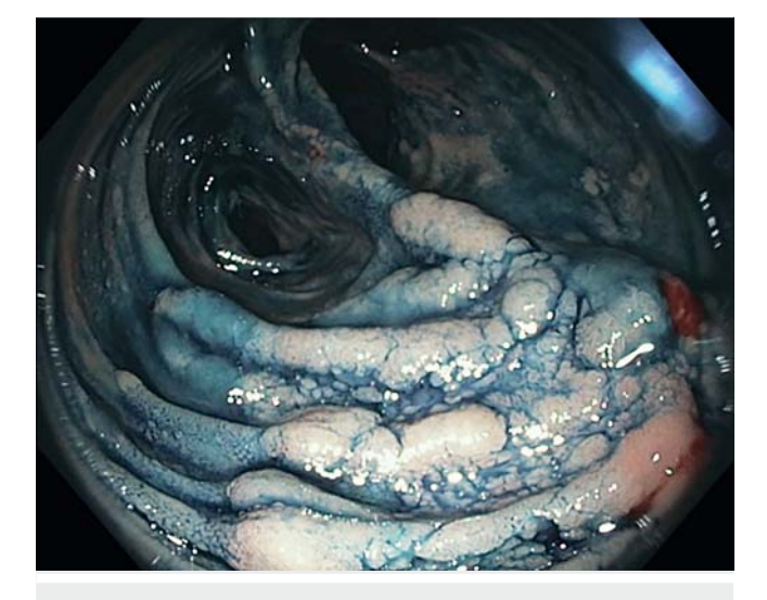
Fig.2 Same ileal pouch with multiple flat adenomas and indigocarmine dye showing numerous large flat adenomas.