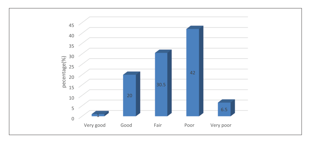
Figure 2. Perceived health status of the respondents.