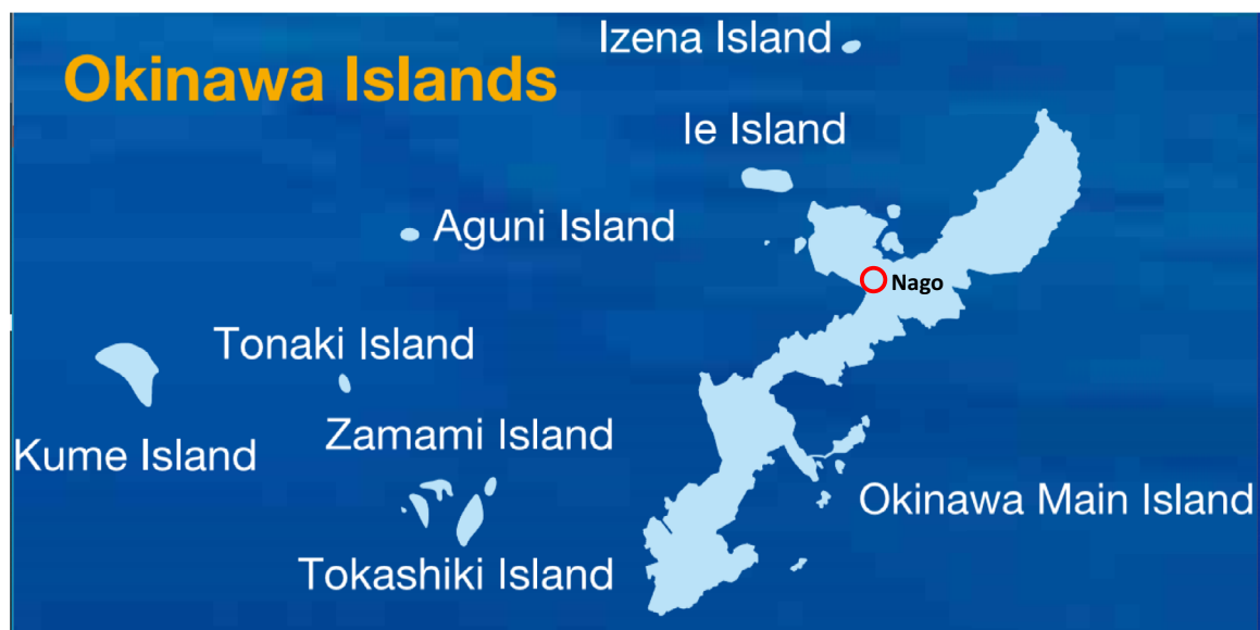
Figure 1 Vegetation and location of Ooitabi. Ooitabi grows in Nago City of Northern Okinawa. This is from the official homepage of the Japanese Municipality of Okinawa Prefecture (Download Brochure/Official Website of Okinawa Prefecture; outline of Okinawa Prefecture; https://www.pref.okinawa.jp/site/chijiko/kohokoryu/foreign/english/download.html ).

Among the 3814 Japanese patients who underwent medical check-ups in Okinawa Prefecture, volunteers ( n = 38 ) with upper borderline high BP and dyslipidaemia were asked to drink approximately 200–300 mL of Ishimaki tea a day.