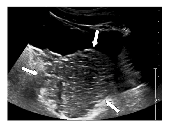
Fig. 1. Longitudinal ultrasound image of the pelvis shows a large, predominantly hypoechoic mass (arrows) posterior to the bladder initially thought to represent prostatic enlargement, although other space occupying lesions could not be excluded, which prompted the subsequent pelvic MRI.

the prostatic and membranous urethra (Fig. 2A/2B). Another mass was discovered in the left groin. The characteristics of the masses were consistent with plexiform neurofibromas without suggestion of malignant transformation.