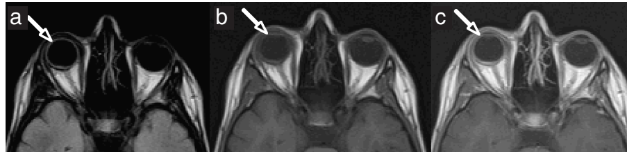
Fig. 2 Brain and orbit MRI with and without gadolinium: hyperintensity around the right ocular globe, more evident after gadolinium. (a) Flair; (b) and (c) T1-weighted images without and with gadolinium

vitritis, macular oedema and exudative retinal detachment [5]. In up to 50% of cases it can be bilateral [5]. Ultrasonography is the key investigation necessary to make a diagnosis of posterior scleritis [4]. Brain CT scan, MRI and fundus fluorescein angiography can also be used. Posterior scleritis responds to therapy with systemic non-steroidal anti-inflammatory drugs, corticosteroids and immunosuppressive drugs [4]. In the International Headache Society Classification [ICHD-2] [6] it is included in the chapter “Headache attributed to ocular inflammatory disorder”, although not specifically mentioned (11.3.4). We report a case of a 26-year-old woman who complained of right-sided ocular pain at onset, not associated with visual disturbances. The diagnosis of ocular pain, especially if not associated with ocular signs or visual loss, may be a challenge for the clinician. Differential diagnosis of ocular pain is discussed.