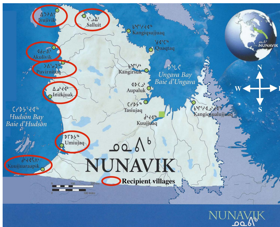
Figure 1 Map of Nunavik.

In September 2011, 10 years after its first iteration, the Inuulitsivik Health Centre, with funding from the Nunavik Regional Board of Health and Social Services (NRBHS), reinstated the initiative. It is important to note that it was not a formal public health programme with a structured administration and secured resources and thus was distinct from other formally implemented programmes or interventions. We therefore refer to the initiative as the AC/DP. In theory, this project was quite simple. Char was fished by local fishermen along the