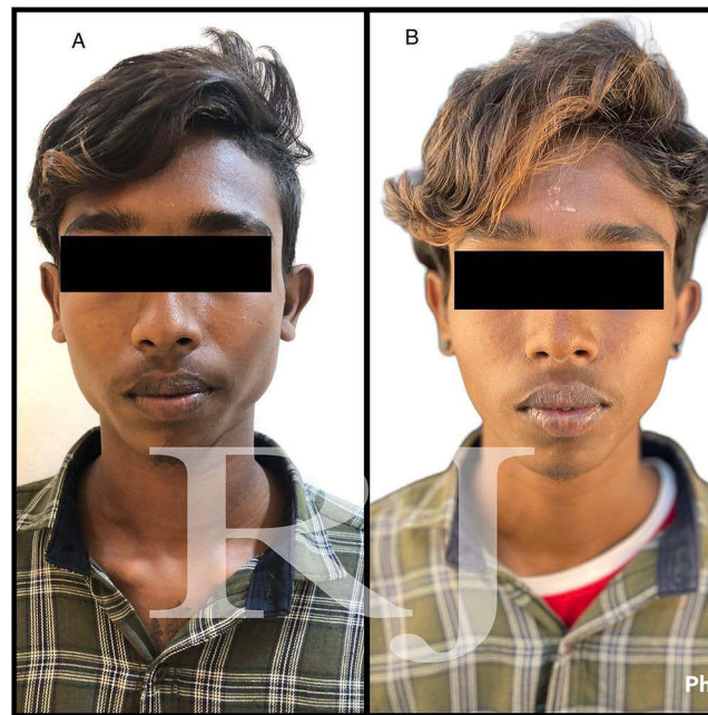
Figure 2 (A) Pre-treatment frontal view of the patient with bilateral masseter hypertrophy. (B) Post-treatment frontal view at 6-month follow up.

Standardized photography was performed to assess facial contour and masseter muscle thickness and the distance from the angle of the mandible to the most prominent point of the chin (pogonion) was compared at baseline and successive follow ups.