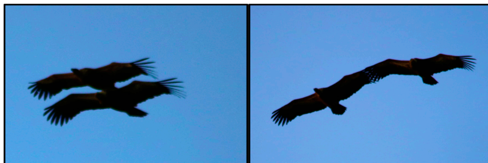
Figure 4. Eurasian griffon performing the nuptial flight ( date: 19 June 2020; location: Su Caule, Bosa—Italy; GPS coordinates: N 40.39430966980878, E 8.40493093114848).

Gyps fulvus are monogamous birds with a slow lifestyle, producing a single chick that takes a long time to grow and has an increased food requirement [88]. The feeding frequency is primarily regulated by the extent of the foraging range [89]. Since the breeding success depends on the availability of carcasses, a source of food whose presence is unpredictable in space and time, the parental investment is directly related to the carrying capacity of the territory near the nest site [23,40]. The reproductive activity starts with the nuptial flights and the nesting in early winter. Nuptial flights are performed in acrobatic mode by partners who fly one on top of the other or “hand in hand” (Figure 4).