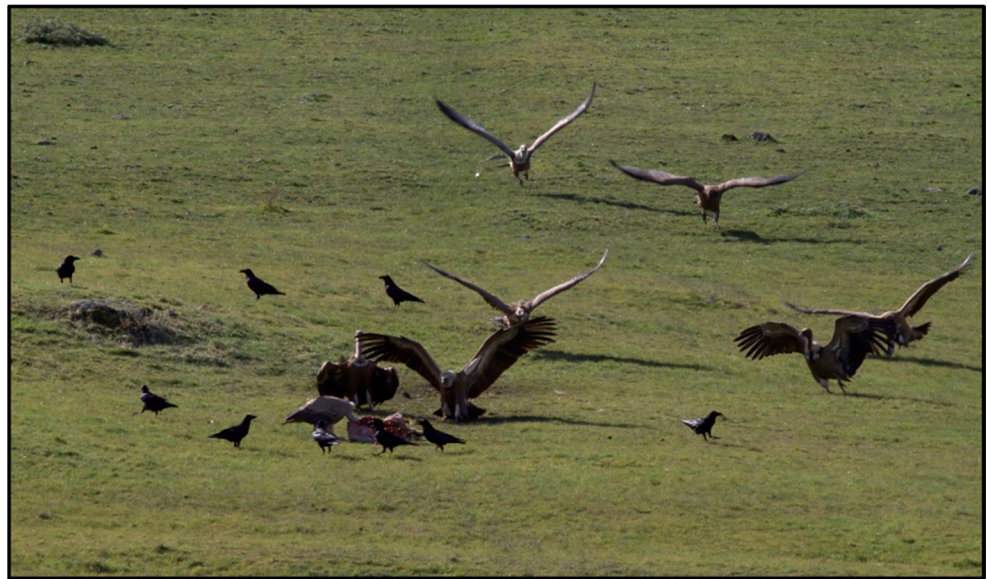
Figure 2. Eurasian griffon surrounding a carcass with crows around waiting for their turn ( date: 12 February 2015; location: Sa Fenzosa, Pozzomaggiore—Italy; GPS coordinates: N 40.4184752, E 8.6828675).

in the nest. Particularly, the raven represents a potential predator of eggs and chicks if left unattended; it also competes with the griffon vulture for carcasses remains (Figure 2).