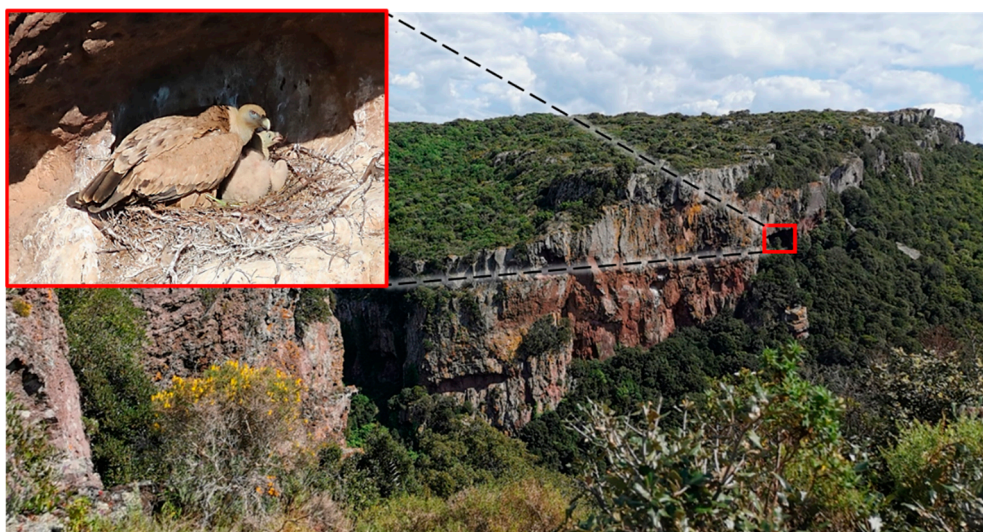
Figure 1. Breeding habitat of the Eurasian griffon with small caves in vertical cliffs. Inset shows an adult attending the chick in the nest ( date: 16 May 2018; location: Badde Aggiosu, Bosa—Italy; GPS coordinates: N 40.30163803046105, E 8.516893362179143).

The vertical cliffs are the preferred nesting sites of the Eurasian griffon as well as most species of Gyps , except for G. indicus and G. africanus , both adapted to use trees. The cliffs are high areas of rock with a very steep side, often on a coast, where the erosive action of water generated small caves, ledges and protrusions, making them ideal nesting sites well protected against potential predators [51] (Figure 1).