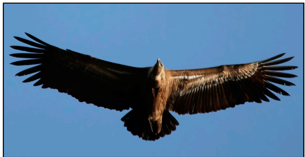
Figure 3. Adult Eurasian griffon in soaring flight ( date: 19 June 2020; location: Monte Crispu, Bosa—Italy; GPS coordinates: N 40.333666183095346, E 8.533662984449215).

The Eurasian griffon is sedentary, but it can colonise new areas thanks to the dispersal behaviour of young individuals which are driven to explore new territories by overpopulation or reduction in food availability. The evolutionary adaptation of the wing structure allowed the Eurasian griffon to adopt the soaring flight, an energy-efficient style that minimise the energy cost by using environmental resources such as rising air currents [54] (Figure 3). Due to this flying style, the Eurasian griffon usually flies over land and is very reluctant to cross even short distances over the sea, where the absence of ascending thermal air currents associated to crosswinds may change speed and/or direction of flight [55]. At the beginning of the colonisation process, information derived from habitat features is crucial in determining the colony settlement, while social information between conspecifics becomes predominant when the colony expands [56].