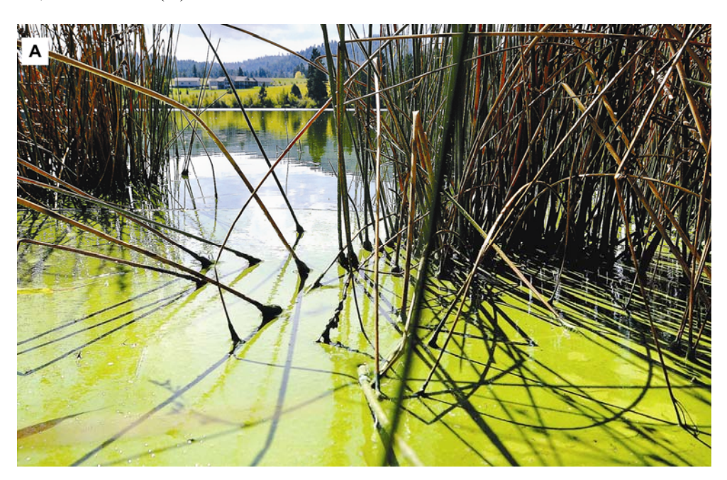
Figure 1. Algal bloom caused by the cyanobacterium Microcystis aeruginosa in Middle Foy Lake near Kalispell, Montana in September, 2010.  [16] ( A ); Confirmation of this bloom as M. aeruginosa microscopically (cell size 2–3 μm) and detection of high concentrations of the cyanobacterial hepatotoxin microcystin-LA in surface scum was performed by scientists at the University of California, Santa Cruz ( B ).

Death from microcystin intoxication has been reported in fish [1,2], birds [2,3], companion animals [4–6], livestock [7,8], wildlife [9,10] and humans [11,12], and significant blooms can cause widespread morbidity and mortality [13]. Microcystins are structurally diverse cyclic heptapeptides that are primarily considered as hepatotoxins [14], although the gastrointestinal tract, kidney and other organs are also susceptible to toxin-mediated damage [15]. Human and animal exposure to microcystin typically occurs through ingestion of contaminated water or food, or by licking contaminated fur.