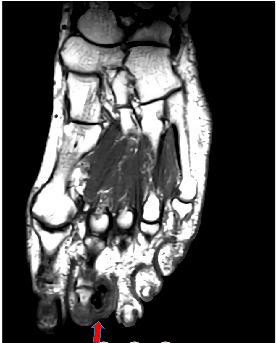
FIGURE 2: A hypointense lesion was seen on MRI.

An excisional biopsy of the lesion was carried out with clear margins. The neurovascular structures were preserved. A small part of the cortex was excised as part of the planned margin, bearing in mind the possibility of parosteal osteosarcoma or periosteal chondrosarcoma. A postoperative X-ray image is shown in Figure 3.