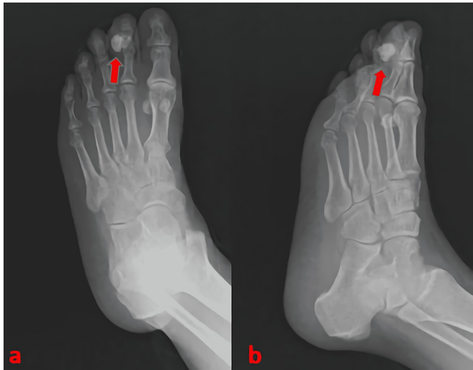
FIGURE 1: Preoperative X-ray images.

MRI with and without contrast was performed. MRI displayed a 13.6 x 8 mm, T1-T2 hypointense lesion with no contrast enhancement or soft tissue component (Figure 2).