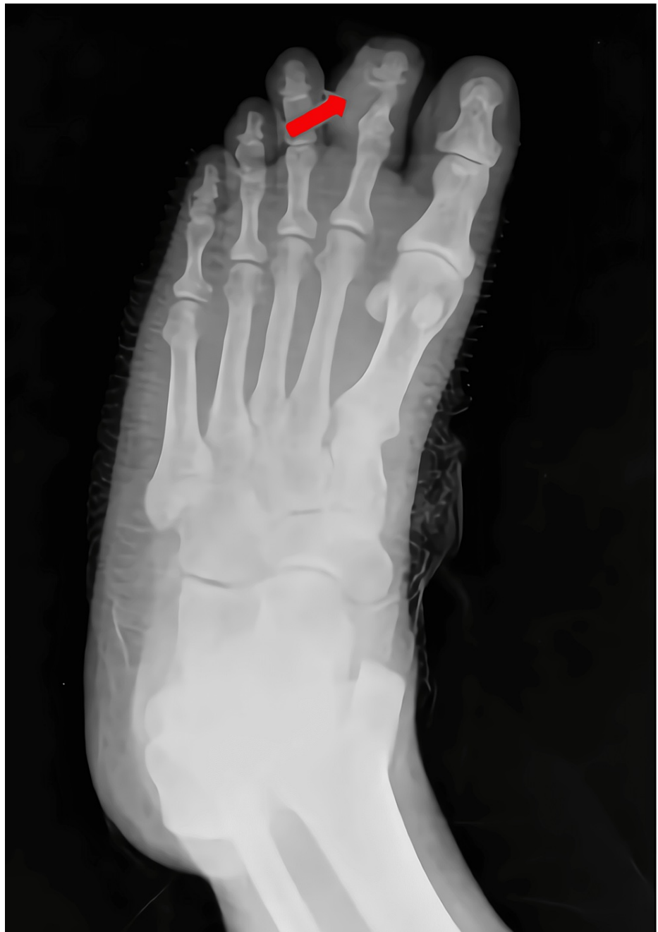
FIGURE 3: Postoperative X-ray image.

Histopathology of the excised lesion showed that the mass was covered by a thin fibrous capsule in most areas. In cross-sections, immature irregular bone trabeculae surrounded by active osteoblasts were observed in a loose fibrous stroma consisting of spindle cells. One-half of the lesion showed an island consisting of chondrocytes with enlarged nuclei and binucleation was observed (Figure 4).