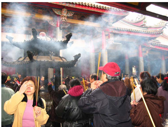
Figure 1 Incense burning during Lunar New Year in the Long-Shang Temple in Taipei, Taiwan. Apparently, the dense incense smoke inflicted irritation in the eyes of a worshiper.

Depending on its makers and local custom, incense sticks have several commercially available types, such as Chen Shan (Shan means incense), Gui Shan, Hsing Shan, Lao Shan, and Liao Shan. However, the physical characteris-