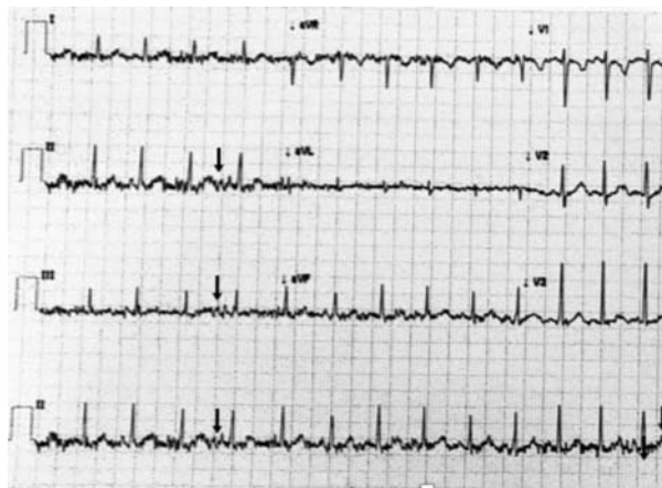
Fig. 1 Electrocardiogram of the index patient showing the high frequency (30-40 Hz) tremor (arrows) due to muscle fasciculations (seen predominantly in limb leads).

muscular dystrophy and limb girdle muscular dystrophies) and SMA type 3. It may be difficult to differentiate these conditions based on deep tendon jerks and creatine kinase levels because these are often misleading. Deep tendon reflexes may be preserved in SMA type 3 [1]. Joint hypermobility and hyperlaxity, although an overlooked feature of SMA, if present favors a diagnosis of SMA over muscular dystrophy [2,3]. The caveats include early-onset muscle disorders such as congenital muscular dystrophies and congenital myopathies [2]. In SMA,