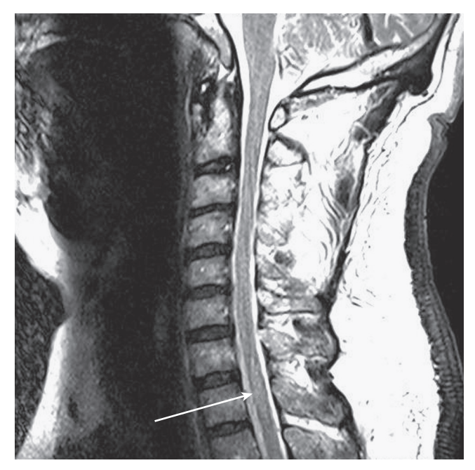
FIG. 162.1 Myelitis: T2-weighted magnetic resonance image of the sagittal cervical spine with fusiform lesion at C7-T1 (arrow).

dexterity for self-care, is independent with a manual wheelchair, and should be able to self-catheterize. Preservation of upper thoracic innervation allows a greater degree of trunk control, increasing stability during use and propulsion of a manual wheelchair. It also adds to ease and independence with bladder and bowel self-management. With bracing of the hips, knees, and ankles (KAFO or knee-ankle-foot orthoses), minimal ambulation can be attempted, although mainly for training and exercise purposes than truly functional. Independent ambulation, even with bracing and bilateral axillary or forearm crutches, is usually not realistic unless the patient has preservation of some upper lumbar innervation. Further preservation of lumbar and sacral innervation will increase ease of ambulation with better trunk and pelvic control. The patient with incomplete spinal injury is less predictable, and functional abilities will largely depend on the degree and nature of neurologic preservation.