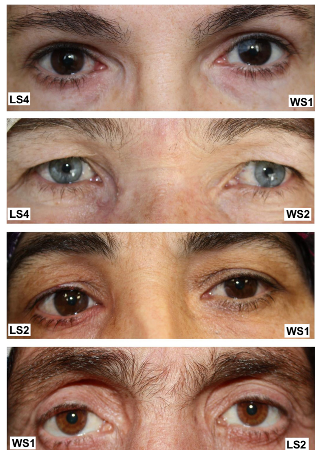
Figure 2 Appearance of patients graded according to the evaluation performed by the first ophthalmologist.

Abbreviations: LS, linear skin; WS, W-shaped.