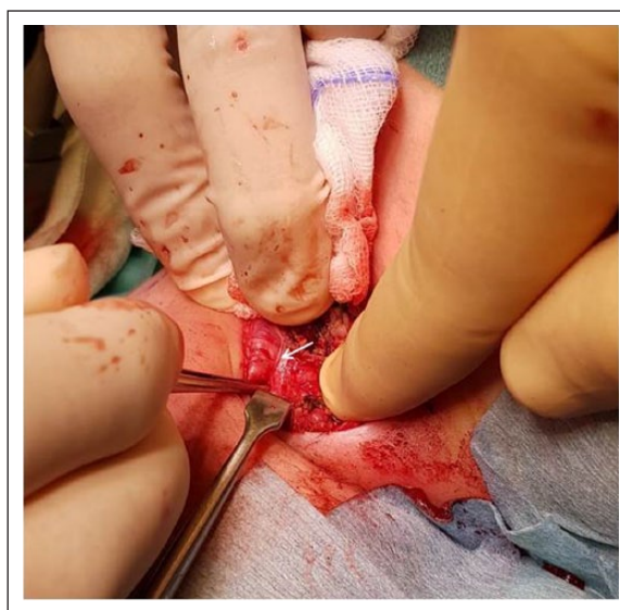
Figure 2. Intra-operative view of the strict anatomical relationship between stage IV non-tuberculous mycobacterial lymphadenitis and the adjacent spinal accessory nerve (arrow).

The management of children with cervico-facial NTML is challenging: medical protocols consist of long-term anti-mycobacterial treatment with a clarithromycin-based multi-drug regimen, but the infection may progress and untoward events may be responsible for treatment discontinuation. 12 A watchful waiting strategy has been advocated by some authors on the grounds that NTML is essentially a self-limiting disease and complications unrelated to cosmetic appearance are extremely rare in immunocompetent children. 9 Surgical strategies include complete excision, incision and