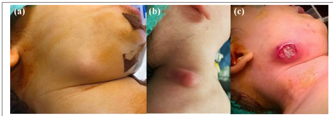
Figure 1. Non-tuberculous mycobacterial lymphadenitis of the head and neck: stage II (a), stage III (b), and stage IV (c).

A nerve stimulator was used in all of the cases in order to evaluate the preserved functional integrity of the marginalis mandibulae or the accessory spinal nerve. Permanent marginal mandibular nerve palsy occurred in one patient (10.0%), but there were no other complications and no recurrences before the end of the follow-up period, which ranged from 3 to 39 months.