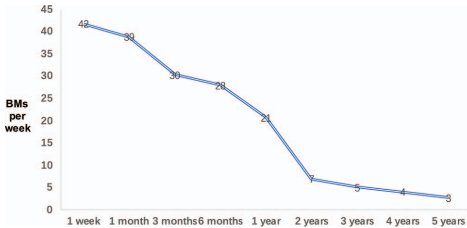
Figure 2. Frequency of bowel movements (BMs) vs time after surgery.

constipation are tabulated in Figure 3B by the patients with a 10-cm VAS. In Figure 3A, the overall symptom were improved by time, and significantly got better at the 2nd year after the surgery. The detail scores of Figure 3A were 2.35 \pm 0.65 at the 6th month post-operation, 2.69 \pm 0.17 at the 1st year post-operation, 3.32 \pm 0.12 at the 2nd year post-operation, 3.46 \pm 0.12 at the 3rd year post-operation, 3.51 \pm 0.11 at the 4th post-operation, and 3.66 \pm 0.10 at the 5th post-operation. Interestingly, the trend of recovery was also found in Figure 3B, in which severity of constipation was largely improved at the 2nd year around after the surgery. The data of Figure 3B were 5.50 \pm 0.15 at the 6th month post-operation, 4.43 \pm 0.16 at the 1st year post-operation, 2.47 \pm 0.15 at the 2nd year post-operation, 2.36 \pm 0.13 at the 3rd year post-operation, 2.09 \pm 0.11 at the 4th post-operation, and 1.93 \pm 0.10 at the 5th post-operation. However, in both Figure 3A and B, the recovery of STC were tending to become steady, without getting much better or worse from the 4th year on after the surgery. Even constipation in some of the patients recurred somehow at the 5 years after the surgery, who had to turn to laxative resolved. All the patients were satisfied with the outcome of the surgery comparing with the symptoms pre-operation.