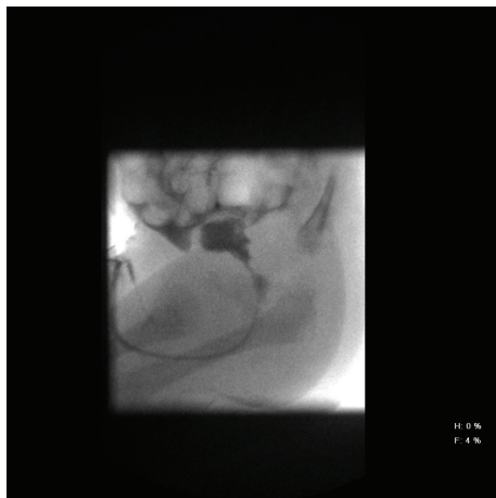
FIGURE 3: Water-soluble contrast administered via indwelling transurethral catheter. Spontaneous micturition on early filling (approximately 5 mL injected), with immediate extravasation of contrast into the peritoneal cavity. The study was therefore terminated, before the posterior urethra could be adequately evaluated. Bladder rupture is confirmed.

in any of them. One of the cases was a posterior urethral valve. Urinary ascites in posterior urethral valve can occur as a result of rupture of calyceal fornixes or transudation across the intact upper tract. It can also occur following the rupture of bladder wall. In obstructive uropathy, the upper tracts are subjected to high pressures in the intrauterine life. This affects the development of the kidneys and cystic renal dysplasia ensues. However, protective mechanisms do exist