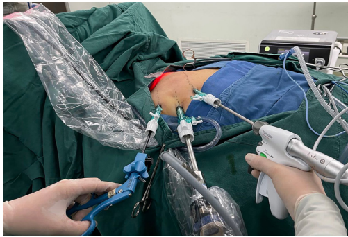
Figure 1 Schematic diagram of the ETAB. ETAB, endoscopic thyroidectomy via the axillo-breast approach.

comparable, we analyze the intraoperative and postoperative data of patients.