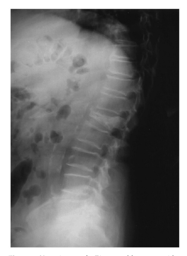
Figure 1. X-ray image of a 71 years old woman with aortic calcifications, low bone density and a vertebral fracture.

VC is an active tightly regulated process driven by trans-differentiation of the physiological contractile VSMCs within the vascular wall into a "calcific" osteogenic/osteoblastic phenotype, with the phenotype-switching leading to the deposition of hydroxyapatite mineral in the intimal and medial layers of the arterial wall associated with increased risk for cardiovascular disease [9]. Although both intimal and medial calcifications of the vascular wall are primarily initiated by osteogenic/osteoblastic VSMCs, there are clear differences in their pathologic features, driving factors and differential deleterious effects on the cardiovascular system leading to arterial stiffness, ventricular dysfunction, heart failure and obstrucive disorders such as myocardial infarction and stroke [10].