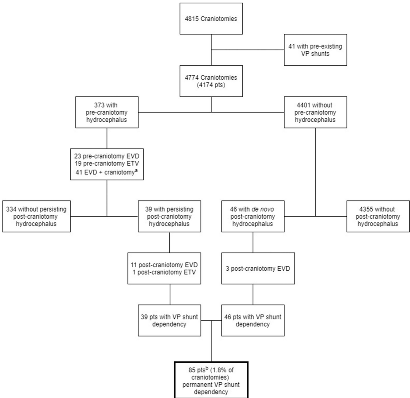
Fig. 1 Flowchart illustrating all cases leading to VP shunt dependency after craniotomy for intracranial tumors. VP shunt – ventriculoperitoneal shunt. a : EVD insertion and craniotomy for brain tumor simultaneously. b : 2.0% of patients

hydrocephalus and became shunt-dependent (Fig. 1). Thus, out of the 4774 craniotomies, a total of 85 patients (2% of patients, 1.8% of craniotomies) became shunt-dependent (Fig. 1). There were 44 males (48.2%) and 41 females (51.8%) (Table 1). Sixty-eight patients (80.0%) had supratentorial tumors, while 17 patients (20.0%) had an infratentorial tumor location (Table 1). The median patient age at time of shunt insertion was 61.9 years (range 23.5–81.6 years) (Table 2).