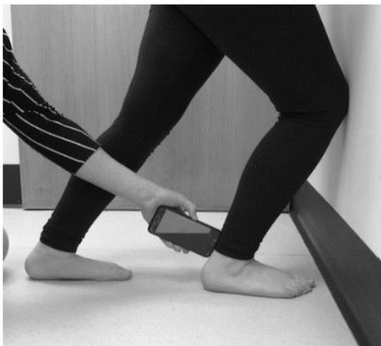
Figure 1 Position of weight bearing lunge test with iPhone positioning and screen positioning demonstrated.