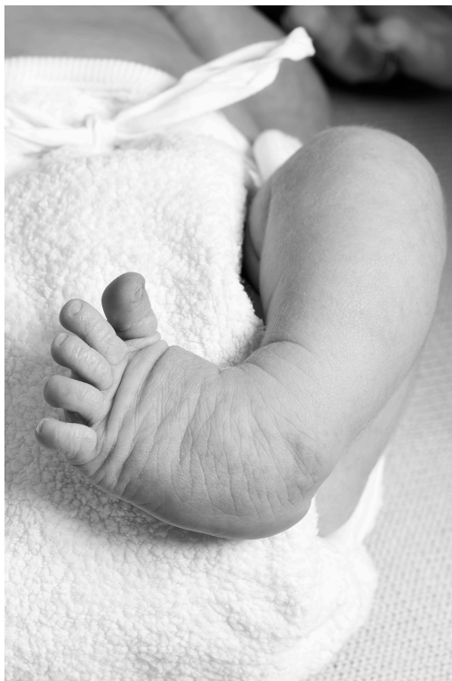
Figure 4 Example of clubfoot with rounded lateral border.