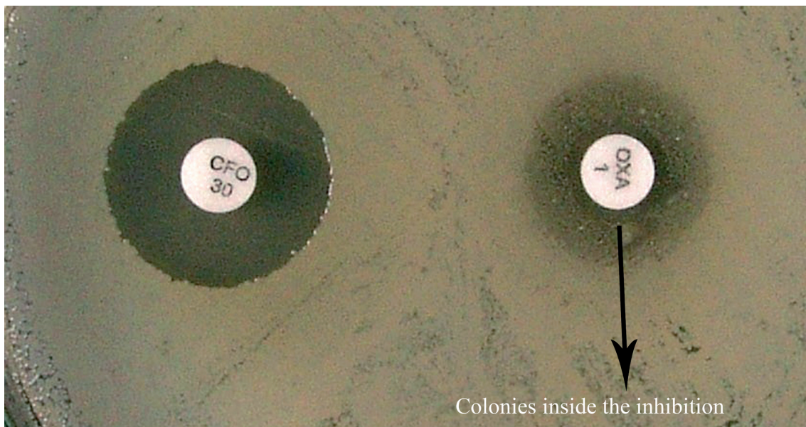
Figure 1. Strain resistant to cefoxitin and growth of colonies inside the inhibition zone, suggesting heterogenous resistance.

resistance. Using 30 µg cefoxitin disks, oxacillin resistance was observed in 18 (18%) isolates and one (1%) presented growth of colonies inside the inhibition zone, suggesting heterogeneous resistance (Fig. 1). Nineteen (19%) isolates were found to be resistant by the agar screening method