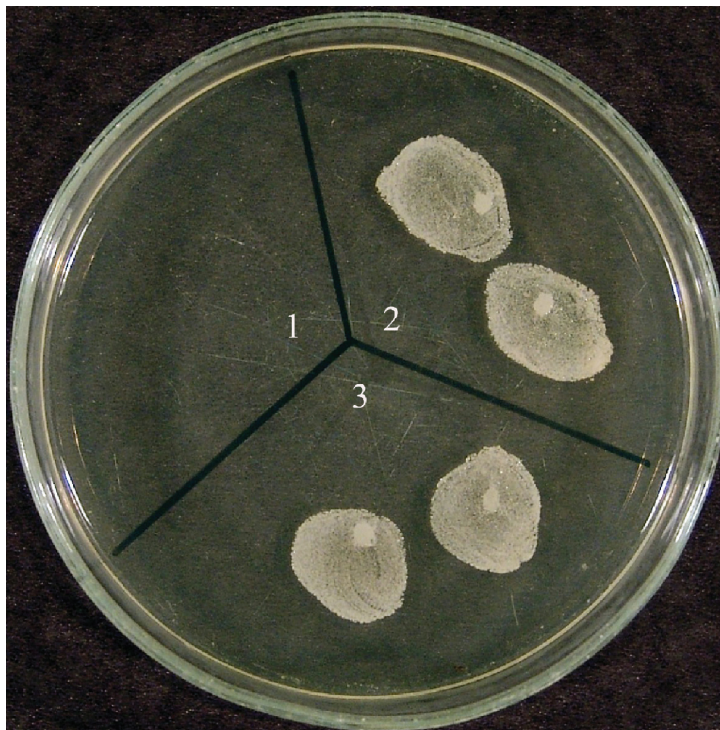
Figure 2. Staphylococcus aureus strains sensitive to oxacillin (1) and resistant to oxacillin (2 and 3) by the agar screening method (Mueller-Hinton agar containing 6 µg/mL oxacillin + 4% NaCl).

PCR revealed the presence of the mecA gene in 18 (18%) isolates. Eleven of these isolates were