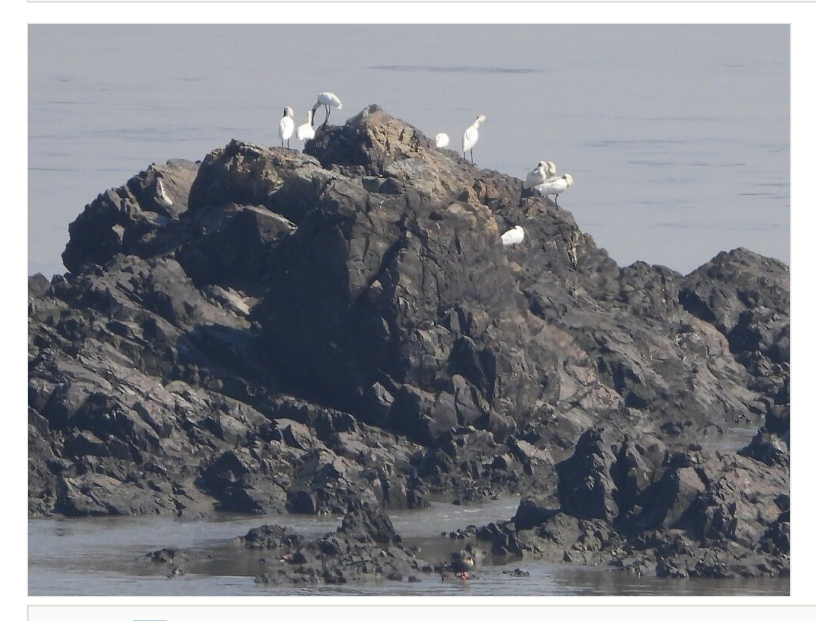
Figure 2. doi Black-faced Spoonbill Platalea minor at Yu Islet

Yu Islet in the Han River Estuary – hundreds of Great Cormorants, Great Egrets, Grey Herons and also some Blackfaced Spoonbills breed here. In the background is the coastline of South Hwanghae Province, DPRK