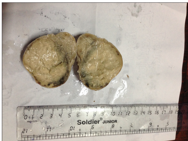
Figure 1: Gross examination

in acute abdominal pain. On gross examination, cut surfaces of luteomas are solid, soft, tan, or flesh colored, with hemorrhagic foci. Microscopically, luteomas are sharply circumscribed nodules composed of polygonal cells arranged in sheets, cords, or small clusters or form follicles containing colloid-like material. The cytoplasm is abundant eosinophilic and finely granular. The nuclei may be slightly pleiomorphic. In 25% of the cases, luteomas are hormonally active leading to secretion of androgens causing maternal hirsutism and virilization. [5] Virilization of the female fetus occurs in half of the patients with maternal hirsutism, which results in clitoral enlargement and ambiguous genitalia. Male fetuses are not affected by this condition. The index case did not show any signs of virilization in either mother or baby; hence, hormonal studies were not done in our case.