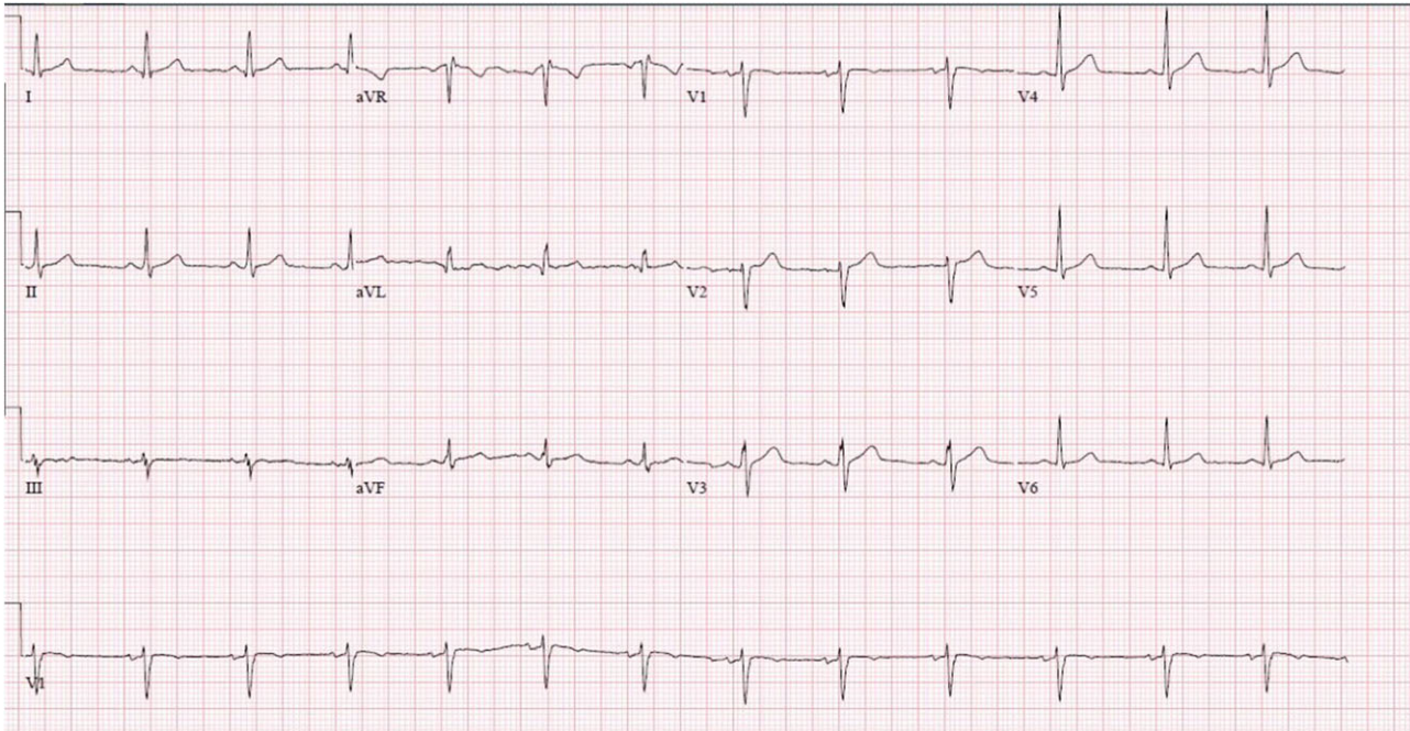
Figure 1: EKG prior to Clozapine initiation.