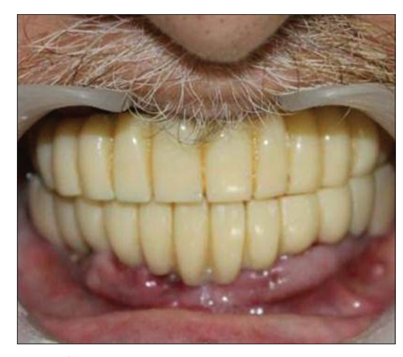
Figure 4: Prosthesis in situ

in the extraction sockets and also in the healed bone. Their structural characteristics allow placement in the bone that is deficient in height and width. Basal implants are the devices of the first choice, whenever (unpredictable) augmentations are part of an alternative treatment plan. The technique of basal implantology solves all problems connected with conventional (crestal) implantology. It is a customer-oriented therapy, which meets the demands of the patients ideally. Yes, this technique is being practiced by some leading implantologist in India, but the very thought of coming out of our comfort zone and trying a new system of implant makes many dentists hesitant.<sup>[8]</sup>