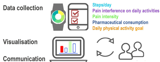
Figure 2 Schematic illustration of the eVIS-intervention's three elements: (i) the data collection element of physical activity level (steps/day), patient reports of interference of pain on daily activities, pain intensity and pharmacological consumption, (ii) the visualisation element of collected data in different graphs and compilations of data and (iii) the communication element. eVIS, eVISualisation.

participation and the indisputable right to discontinue participation in the trial at any time will be provided. Detailed checklists and forms will support these procedures, and these will be easily accessible on the project website.