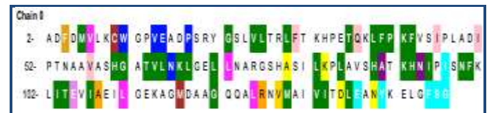
Figure 2: Active site in predicted model computed with CASTp. Green color represents active site with largest area and volume and other colors represent the remaining active site with different areas and volumes.

values (VAL7, VAL14, GLY22, LEU26, ILE51, VAL57, GLY61, LEU72, LEU82, ALA90, ALA108, LEU111, GLY121, LEU125, VAL128, TYR140). The active site amino acids, which are hydrophobic, are VAL7, VAL14, GLY22, LEU72, LEU82, LEU111, VAL128 with low ASA values. While those active site amino acids, which is hydrophilic are LYS42, LYS92, HIS93 with high values. The protein has 22% amino acids are hydrophilic, 50% are hydrophobic and 27% others. Molecular weight of the protein is 15806.42 g/mol, isoelectric point is pH=7.51. The protein has poor water solubility.