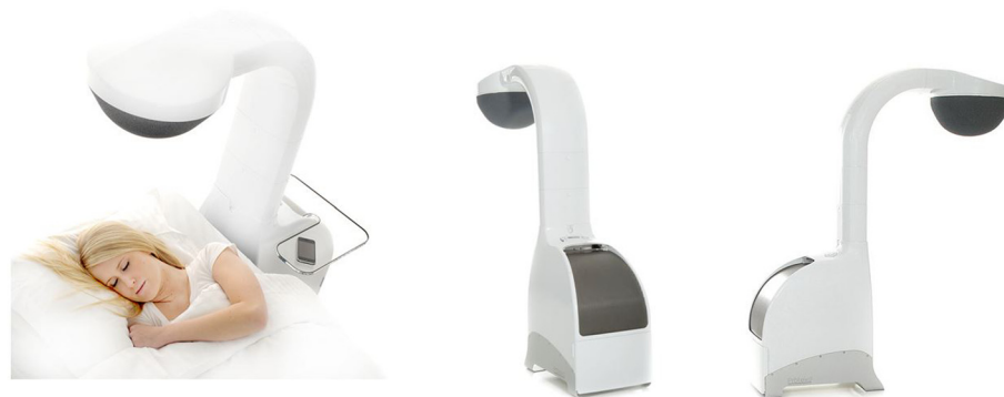
Fig. 2 The temperature-controlled Laminar Airflow (TLA) device (Airsonett.)

The active TLA device (Airsonett™) significantly reduces nocturnal allergen exposure by filtering ambient air through a high efficiency particulate air filter, slightly cooling ( 0.5\text{--}0.8^\circ\text{C} ) and 'showering' it over the participant during sleep (Fig. 2). The reduced temperature allows the filtered air to descend in a laminar stream, displacing allergen-rich air from the breathing zone reducing allergen exposure without creating draft or dehydration. The device is installed next to the participant's bed by a qualified engineer from the company. The device is pre-programmed to turn on and off at times specified by the trial participant but can be turned on and off by manual override if the participant wishes to use the device for an extended period or turn the device