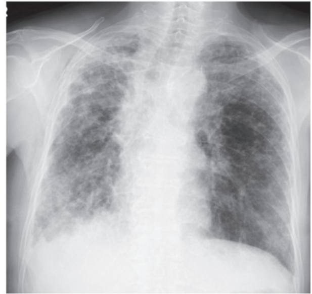
Figure 3. Chest radiograph 8 months after the autologous blood-patch pleurodesis shows no recurrence of pneumothorax.

PSS is a systemic disease that sometimes affects the lungs, resulting in lung fibrosis (1). Diffuse interstitial fibrosis is the most common pulmonary manifestation and pneumothorax is usually associated with the pulmonary complication of interstitial fibrosis (1). The underlying mechanism of pneumothorax is believed to result from the rupture of acquired subpleural cystic spaces associated with the diffuse interstitial fibrosis (2). In patients with PSS with interstitial fibrosis, the distinctive rigidity of lung parenchyma may prevent pre-expansion of the ruptured lung. Additionally, immunosuppressants including corticosteroids, which are frequently used for PSS, may aggravate persistent air leak;