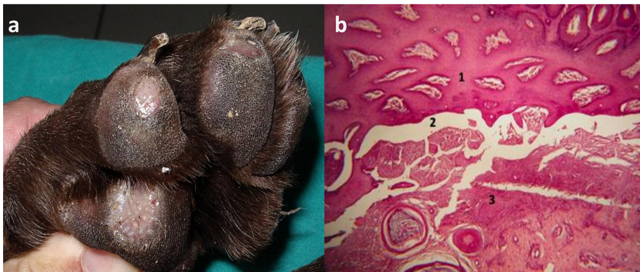
FIGURE 1 (a) Initial ulcerative erosion of the plantar pad of an affected GSP; (b) plantar pad of a Kurzhaar. A histopathological examination was conducted on the lesions which highlighted the dermoepidermal detachment. 1: epidermis, 2: dermoepidermal detachment, 3: dermis. Hematoxylin–eosin staining (100×)