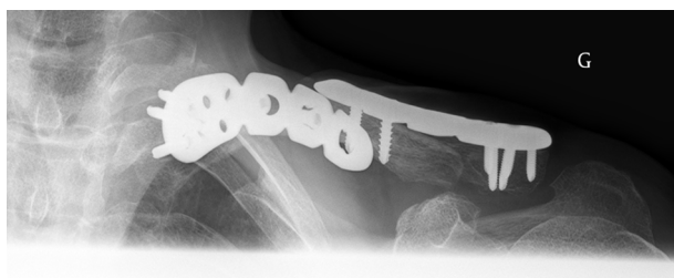
Figure 2. X-Ray at Sixth Month; Axial View of the Left Clavicle Showing Signs of Consolidation