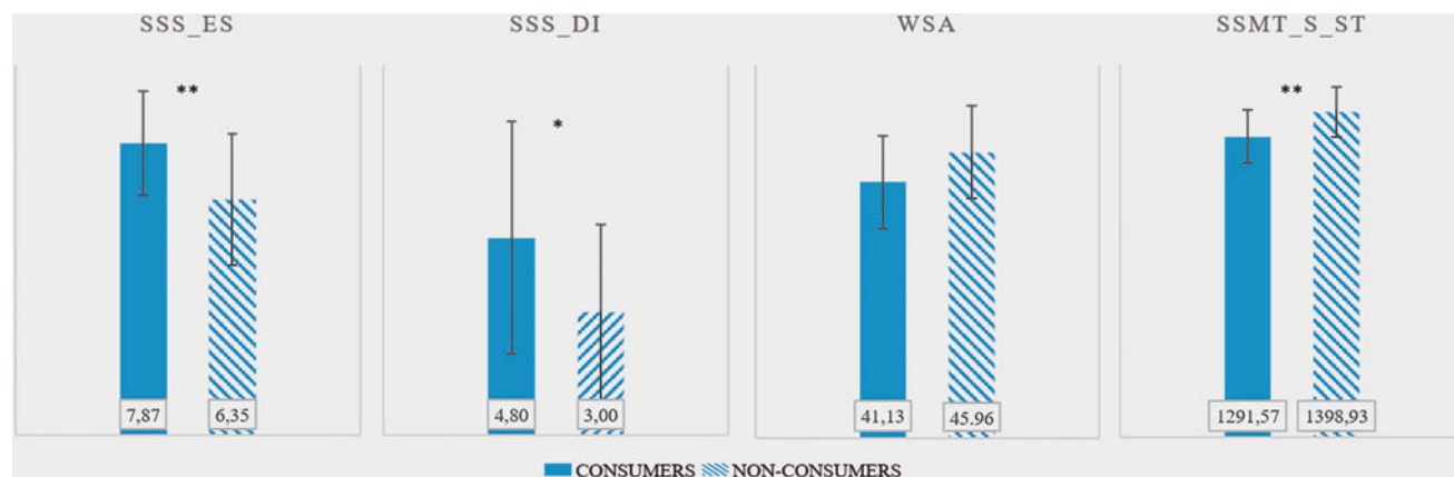
FIG. 4. T -test results of self-report and SSMT variables between marijuana consumers and nonconsumers. Bars represent the average and lines represent the standard deviation. * p < 0.05 , ** p < 0.01 . Color images are available online.

Regarding hypothesis 2, the WSA showed negative significant correlations with “karma” and positive significant correlations with shield use. WSA also showed negative significant correlations with impulsivity and sensation seeking. This could represent a thoughtless individual who gets bored easily, is looking always for new experiences, and has less risk awareness. These results suggest that participants with high WSA anticipated and planned for what was