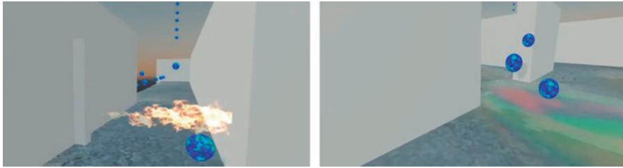
FIG. 1. Screenshots of the SSMT with fire and precipice ( left ) and slippery puddle ( right ). SSMT, Spheres & Shield Maze Task. Color images are available online.