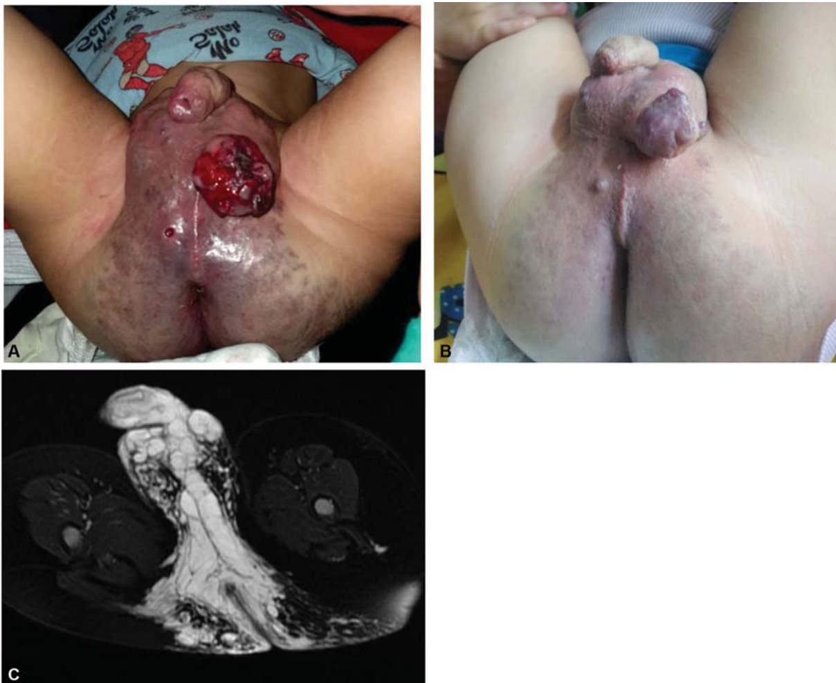
Fig. 1 A 21-month-old boy presenting with extensive venous malformation in the perineum and pelvis. (A) Complicated presentation with chronic bleeding from a fungating skin ulcer. (B) After 3-month treatment with oral sirolimus showing marked improvement of skin lesions. (C) Pelvic magnetic resonance imaging (T2WI with fat suppression): axial cuts through the perineum to demonstrate the extension of the lesion that appeared as hyperintense dilated venous lakes.

A 21-month-old boy was referred to our vascular anomaly clinic with extensive vascular malformation in the perineum and pelvis (–Fig. 1). At day 2 of life, he had bleeding from a scrotal lesion for which a trial of surgical ligation failed resulting in a fungating skin ulcer with persistent chronic bleeding (–Fig. 1A). He had a history of recurrent attacks of severe bleeding per rectum necessitating hospital admission and blood transfusion (three attacks since the age of 7 months). Attacks of bleeding per rectum accompanied severe straining at defecation. Before referral to our clinic, the patient was given a generic diagnosis of hemangioma and started oral propranolol with no improvement.