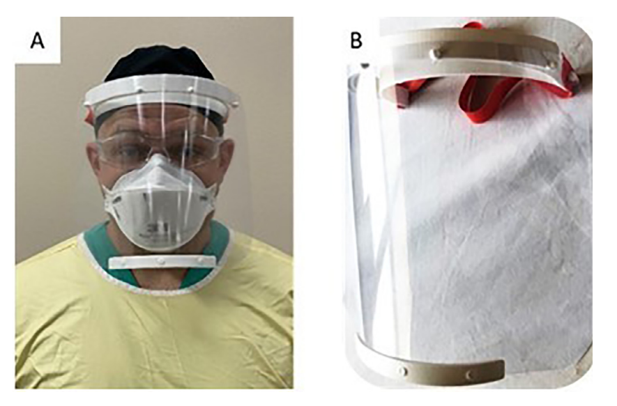
Fig 3. Depiction of the 3D printed face shield. (A) coverage and design, including use of goggles and a standard N95 mask underneath. Note the coverage that extends below the chin; and (B) completed face shield.

creality3dofficial.com/) or the Creality Ender 5 Series that was used to produce face shields in-house for TAMC personnel.