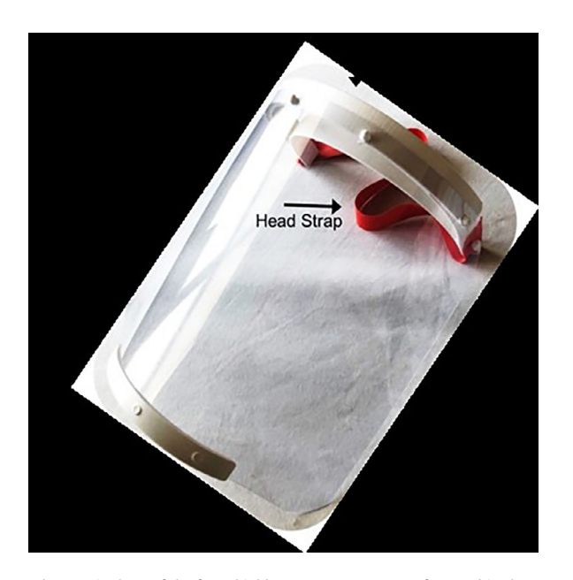
Fig 1. The terminology of the face shield components. Items referenced in the assembly direction refer to the items in Table 1.

Once the .stl file was obtained, it was loaded onto a computer capable of running the slicer software. The slicer software takes the 3D virtual model and determines the process required for the printer to produce the object layer by layer. The slicer printer software can