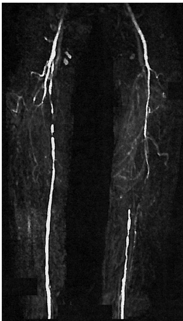
Figure 3. In a 61-Year Old Man, Cut-Off and Run-Off was Located in Superficial Femoral Artery (SFA) and One-Third Distal of Common Femoral Artery (CFA), Respectively by MR-Angiography, During Surgery the Cut-Off and Run Off Was Seen in One-Third Distal of CFA and Proximal of Popliteal Artery, Respectively.

methods of diagnosis (24-26). On the other hand the main question here would be that if these new modalities exactly reflect what happens in the body and how much we can trust on the results provided by these modalities. In this regard we tried to evaluate the predictive value of MRA in means of finding run off and cut off location in patients with PAD and compare what is reported by MRA with what is seen in open surgeries. We found that Gadolinium enhanced MRA is able to report the exact point of cut off and run off in blood flow of lower limb arteries with positive predictive value of 0.97 (95% CI: 0.83-0.99) regardless of the anatomical position of occlusion. Previous studies emphasized the efficacy of MRA in both contrast agent and conventional methods (19-22, 27); As Binkert et al. found a diagnostic accuracy of